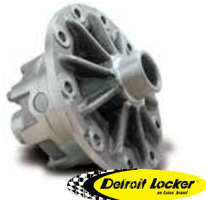
Detroit Locker An Eaton brand

Choose Eaton® to get the most out of your drivetrain.