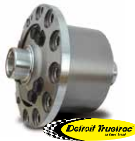
Detroit Truetrac An Eaton brand